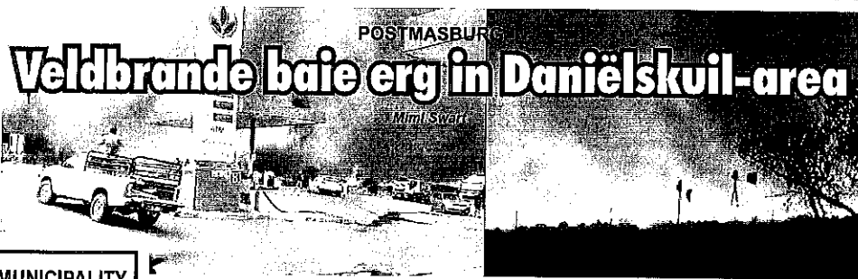
Inwoners kyk magtelos hoe die vlamme al nader aan die vultasie kom.